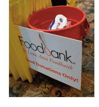
Show visitors donated 128 pounds of food and household items for St. Louis Area Foodbank